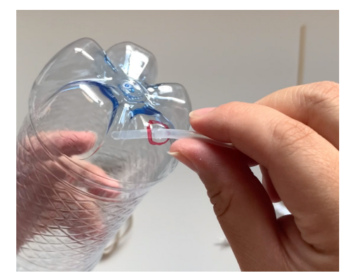
Step 2 - Attach spray nozzle

Take two rubber bands and place them on either side of the bottle. Stretch the rubber bands around the bottle and then use them to secure the spray nozzle. Make sure the top is flush with the bottle and that the hole created is facing down. Use the tape to keep the spray nozzle in place.