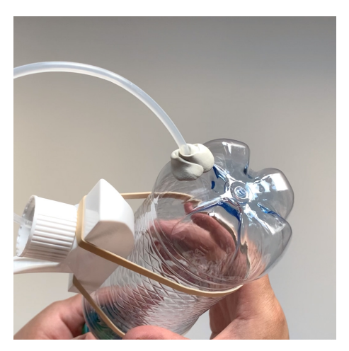
Step 4 - Fill with water

Open the top of your bottle and fill the chamber with fresh water. Give the trigger a few squeezes and test out your new water toy! Make sure you turn the knob of the nozzle to adjust the settings.